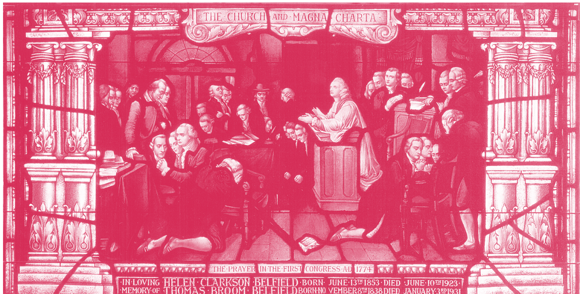
The Prayer Meeting in the first U.S. Congress, 1774