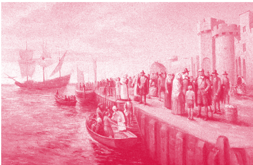
Sailing of the Pilgrims from Plymouth, England, 1620